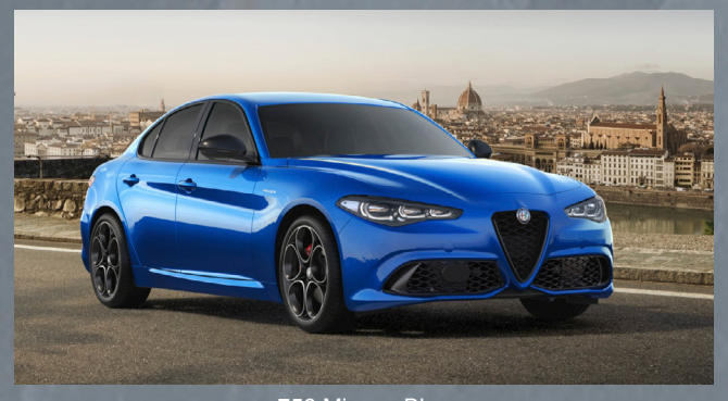
756 Misano Blue Option - Veloce