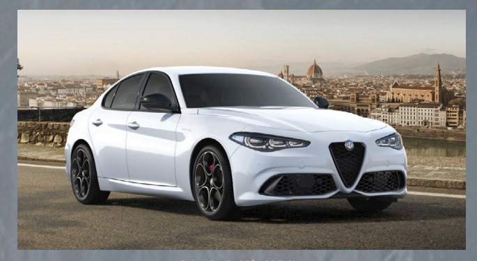
217/240 Alfa White Standard