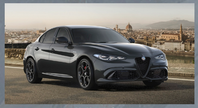
035 Vesuvio Grey Option