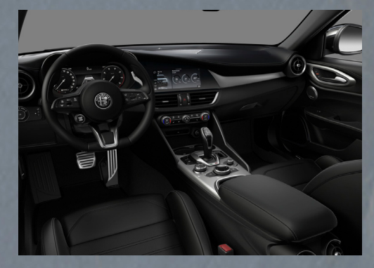
473 Black Sports Leather Standard - Veloce