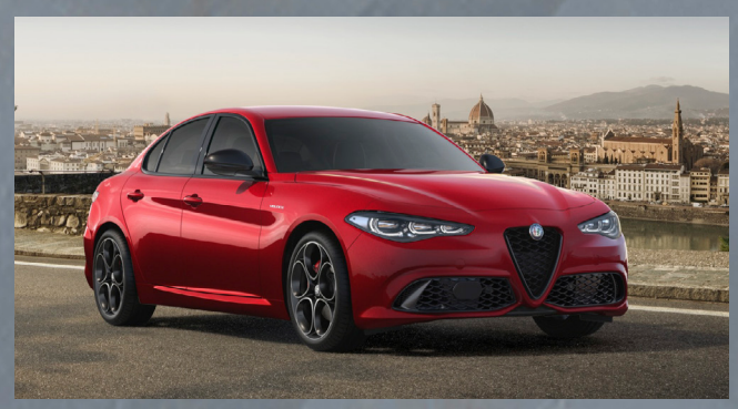
645 Etna Red Option - Veloce