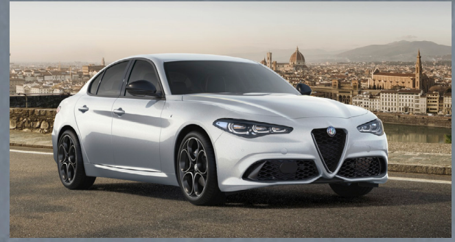
252 Moonlight Grey Option - Ti