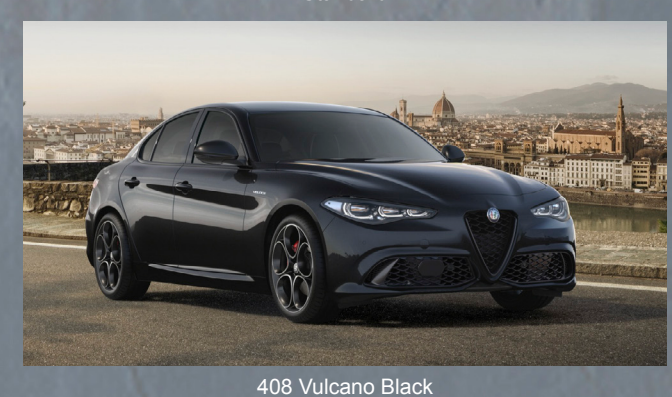
408 Vuicano Blac Option