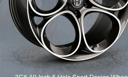
3CX 19-Inch 5 Hole Sport Design Wheel (Standard on Ti and Veloce)