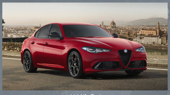
414 Alfa Red Option