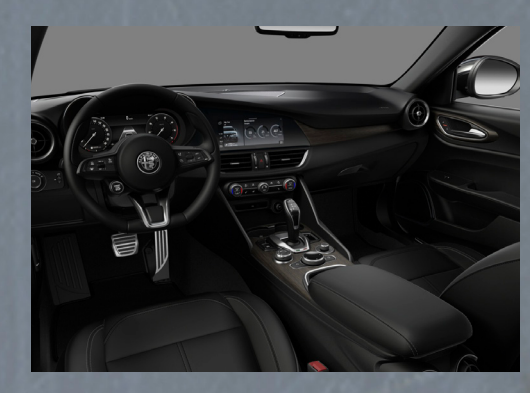
433 Black Leather Standard - Ti