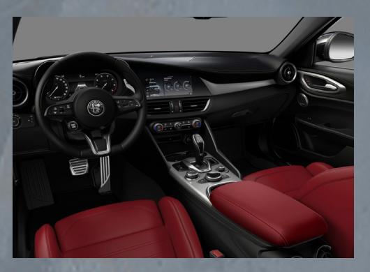
557 Red Sports Leather Option - Veloce