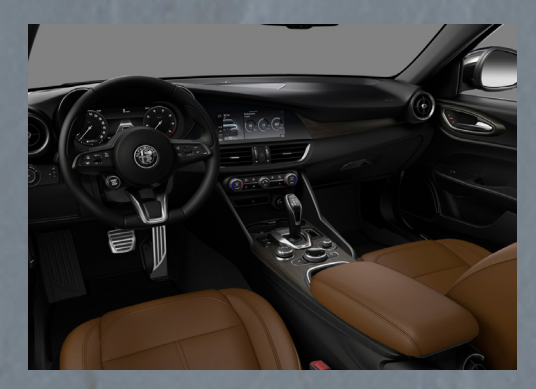
556 Tan Leather Option - Ti