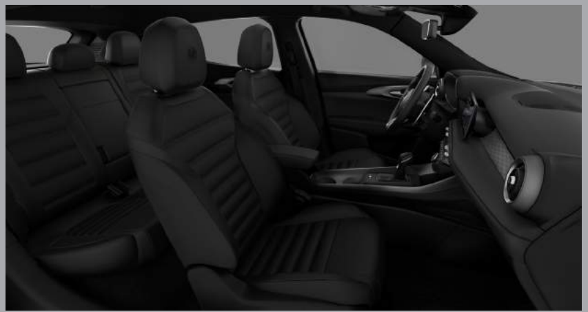
428 Perforated Black LeatherAccented Seats with Embroided Alfa Romeo Logo and Dark Grey Double Stitching (Option on Veloce Hybrid, Standard on Veloce Plug-In Hybrid Q4)