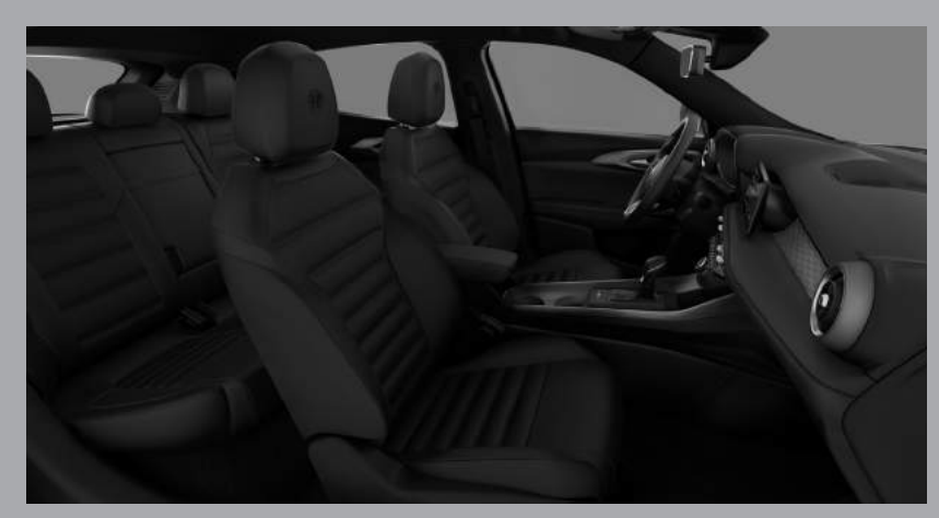
428 - Perforated Black Leather-Accented Seats with Embroided Alfa Romeo Logo and Dark Grey Double Stitching (Option on Ti Hybrid)