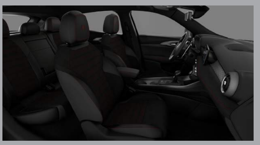
783 - Perforated Black Alcantara and Leatherette Seats with Embroided Alfa Romeo Logo and Red Stitching (Standard on Veloce Hybrid)