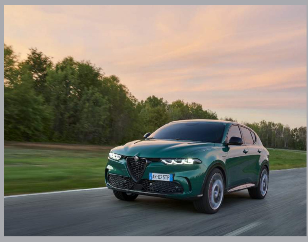
(•) Standard (–) Not Available (O) Option *Customisable Ambient Lighting available from select October 23 production