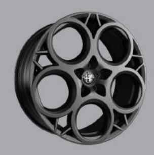
1M4 – Veloce (Option)