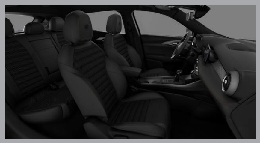
047 - Carbon Cloth and Leatherette Seats with Electro-welded Alfa Romeo Logo and Biscotto Stitching (Standard on Ti Hybrid)