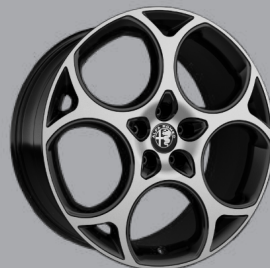
1MM – Veloce (Standard)