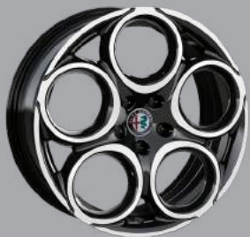
WBR – Ti (Standard)