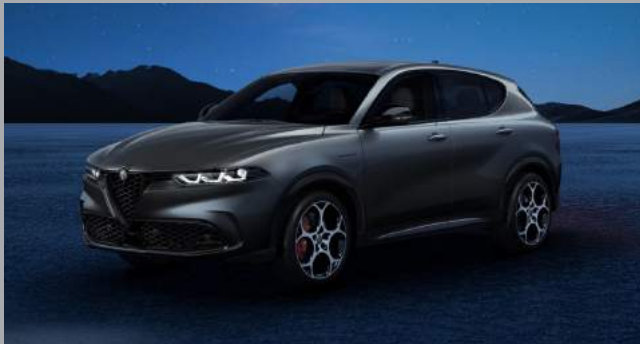
Vesuvio Grey Metallic (3XV)