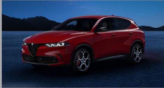
Alfa Red (1WY)