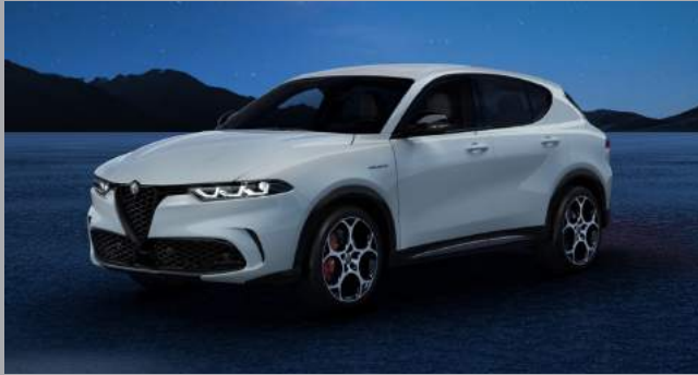
Alfa White (1WX)