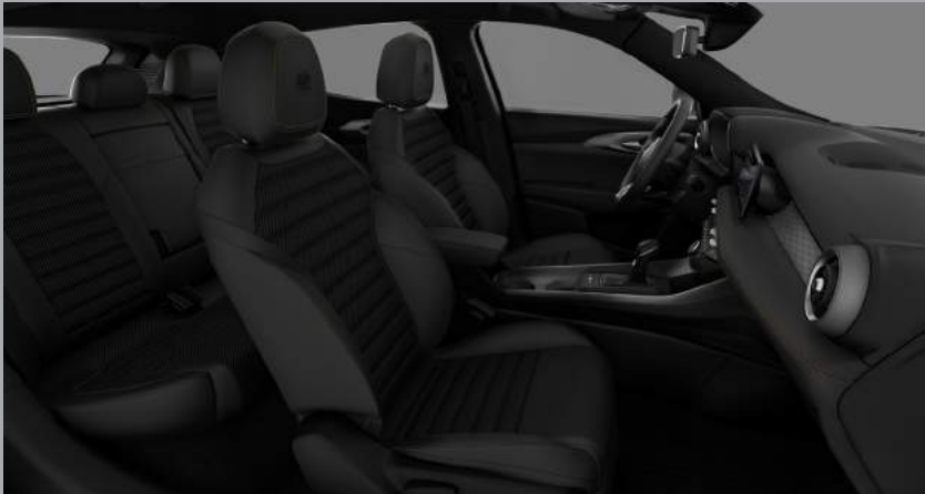
047 - Carbon Cloth and Leatherette Seats with Electro-welded Alfa Romeo Logo and Biscotto Stitching (Standard on Ti Hybrid)