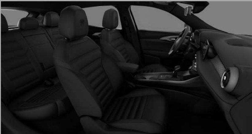
428 - Perforated Black Leather-Accented Seats with Embroidered Alfa Romeo Logo and Dark Grey Double Stitching (Option on Ti Hybrid)