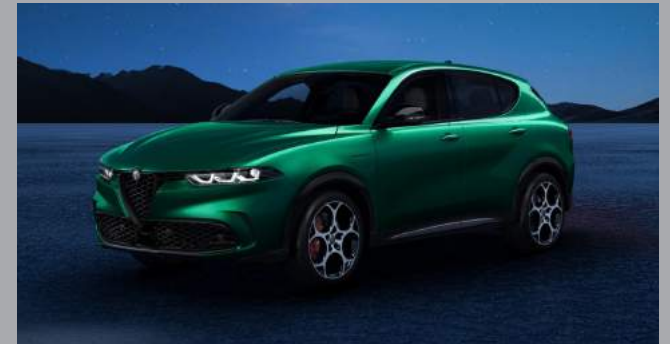
Montreal Green (6FW)