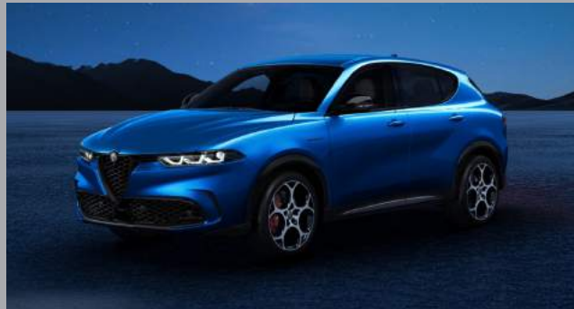
Misano Blue Metallic (3YS)