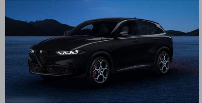
Alfa Black (6FX)