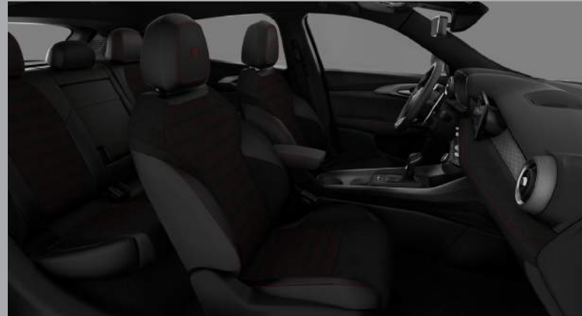
783 - Perforated Black Alcantara and Leatherette Seats with Embroidered Alfa Romeo Logo and Red Stitching (Standard on Veloce Hybrid)